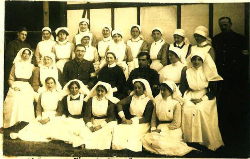
Alexandra Hospital Nursing Staff.