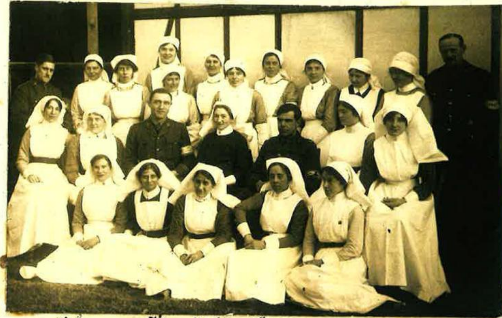
Alexandra Hospital Nursing Staff.