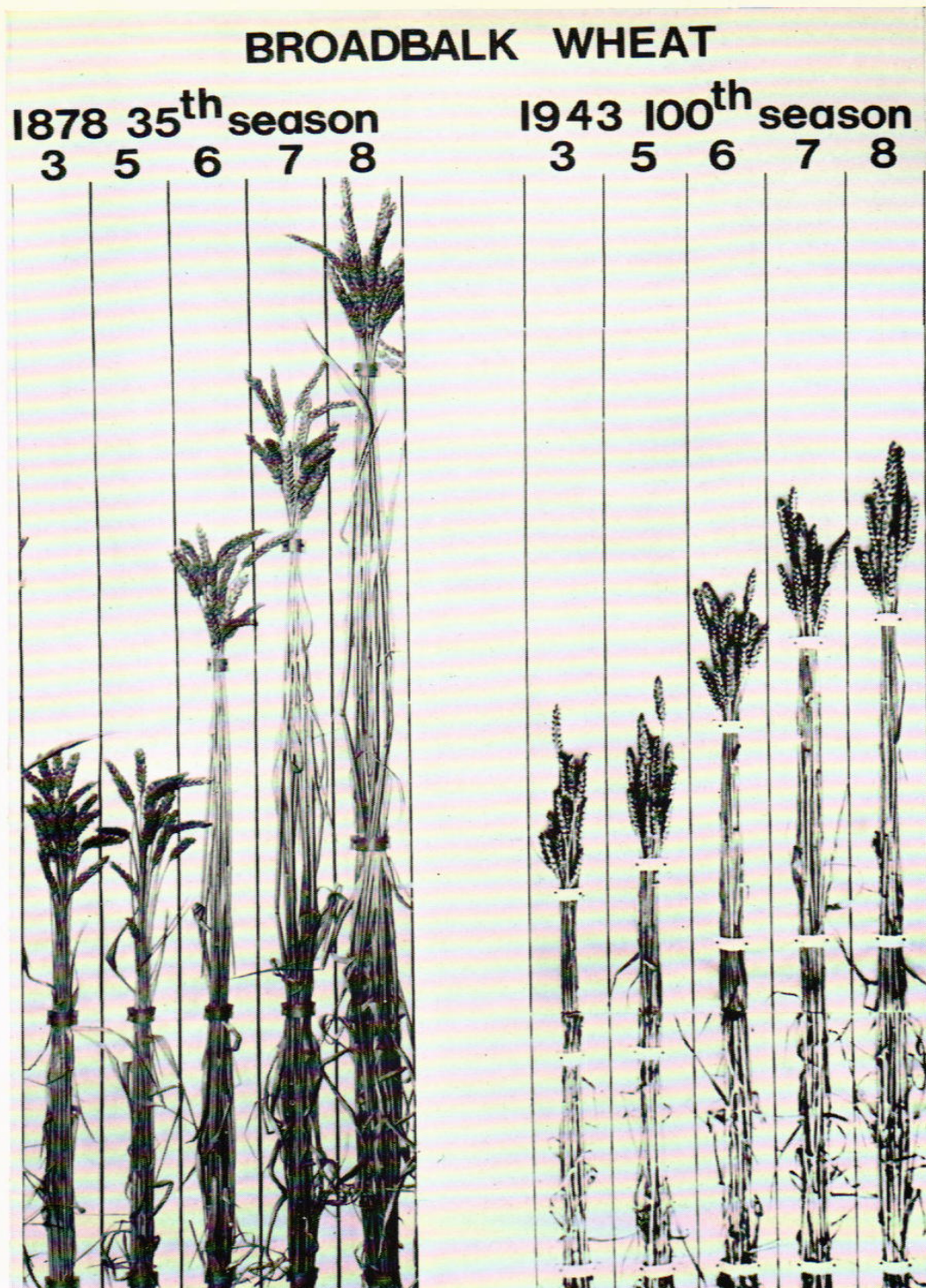
1. Photographs of demonstrations prepared by Lawes and Gilbert in 1878 and by Russell in 1943 which show the similarity in response of winter wheat to fertilisers over the period of the experiment. (The difference in straw length between the two years is irrelevant as the varieties changed between 1878 and 1943, and the characteristics of the two seasons were different.)

Treatments: Plot 3, unmanured; plot 5, PKNaMg; plot 6, N 1 PKNaMg; plot 7, N 2 PKNaMg; plot 8, N 3 PKNaMg.