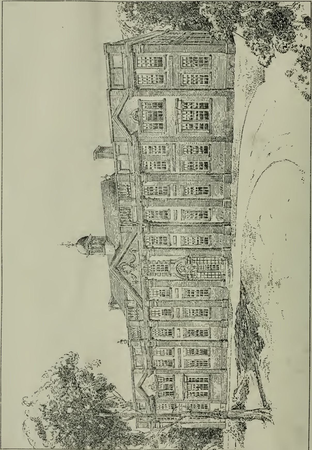
THE NEW ROTHAMSTED LABORATORIES, ERECTED 1914-1916