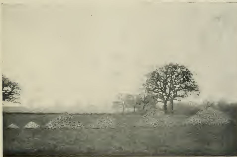
Plots 6 5 4 3 2 1

On the Agdell Field the 16th four-course rotation began with a crop of Swede Turnips, sown on the 12th of June. A very regular plant was obtained, which made good growth throughout the season and showed several interesting features, illustrated by the following photograph taken of the entire crop from each plot.