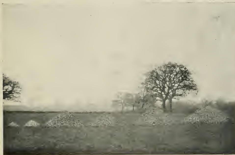
Plots 6 5 4 3 2 1

On the Agdell Field the 16th four-course rotation began with a crop of Swede Turnips, sown on the 12th of June. A very regular plant was obtained, which made good growth throughout the season and showed several interesting features, illustrated by the following photograph taken of the entire crop from each plot.